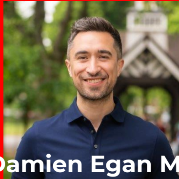
Damien Egan MP